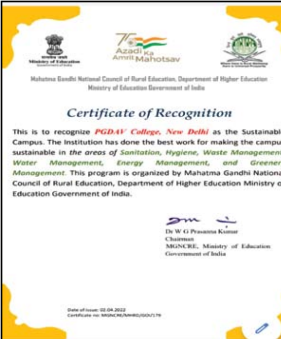
महाविद्यालय द्वारा स्वच्छता, हाइजीन और अपशिष्ट प्रबंधन आदि क्षेत्रों में किए गए उत्कृष्ट कार्यों के लिए शिक्षा मंत्रालय, भारत सरकार द्वारा महाविद्यालय को सस्टेनेबल कैम्पस की मान्यता प्राप्त हुई है।