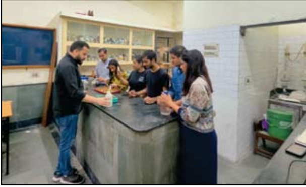
महाविद्यालय द्वारा पर्यावरण विज्ञान विभाग के लिए निर्मित नई प्रयोगशाला